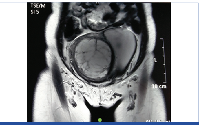
[Table/Fig-1]: Coronal section of MRI showing areas of hyperintensity showing necrosis and increased number of blood vessels.

A 38-year-old married female consulted the Obstetrics and Gynaecology OPD for lower abdominal pain that had persisted for the past two months. The abdominal pain was described as dull and aching. Apart from this, there were no other complaints. The general examination was normal, but the local pervaginal examination indicated the displacement of the cervix to the left. The laboratory investigations, which included a complete blood count, liver function tests, kidney function tests, and urine routine and microscopy, were unremarkable. The Magnetic Resonance Imaging (MRI) scans revealed a solid cystic mass measuring 13.4×11.2×15 cm, with areas of high signal intensity that appeared necrotic, along with solid parts and blood vessels has been depicted in [Table/Fig-1]. The mass was located in the right adnexa and had displaced the entire uterus to the left-side. A radiological diagnosis of suspected right parametrial leiomyoma was offered [Table/Fig-1].